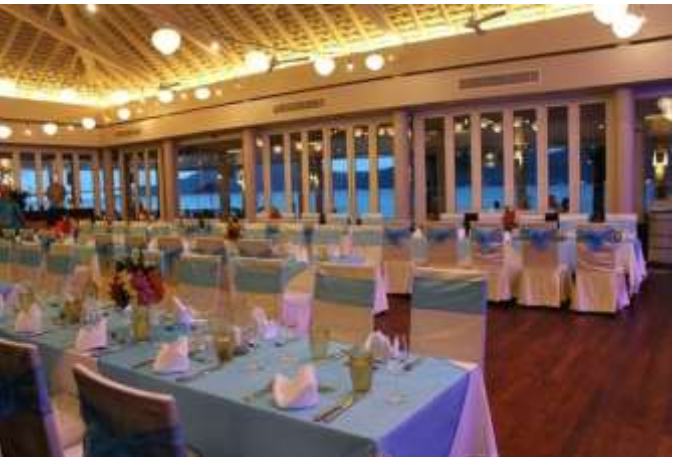
La Gritta Restaurant