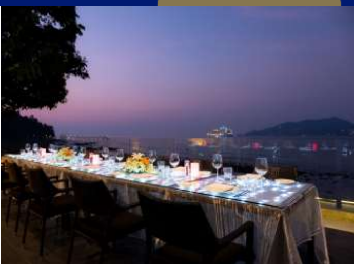
The Jetty (Private event only)